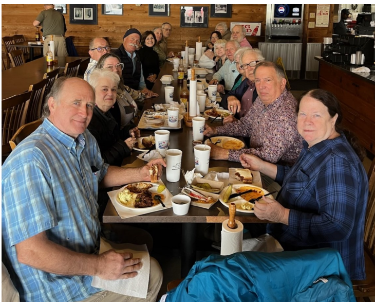
Lunch Out at Meyer's Elgin Smokehouse on February 23