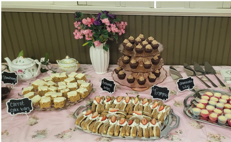
Charming teapots added to the ambience!