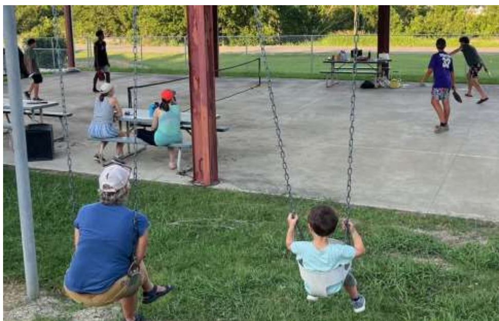
Enjoying pickleball at the sports court in the pavilion.