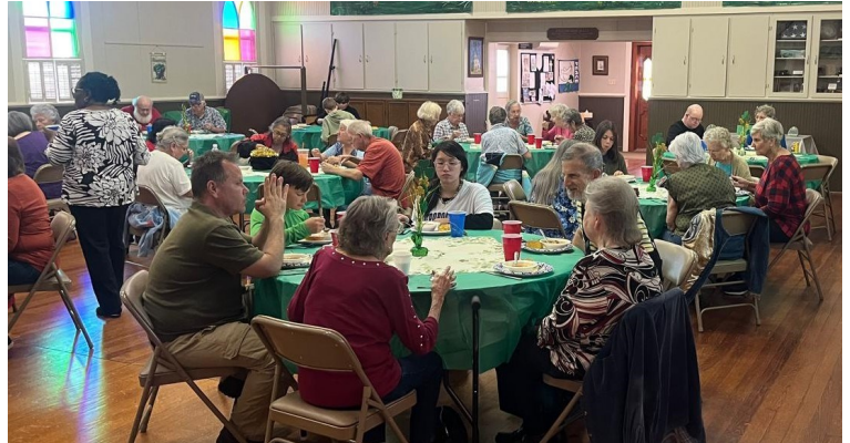
Community Senior Luncheon, March 18