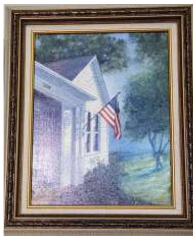
St. Peter's Parsonage

The auction ends on Sunday, March 26 (at the Potluck Lunch) and winners must pay for and pick up their paintings by April 2.