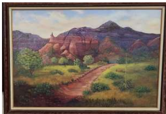
Palo Duro Canyon

Proceeds will go toward replacing the St. Peter's playground.