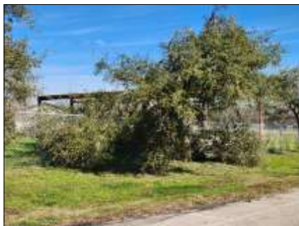
Trees down outside church