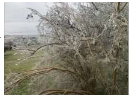
Ice on tree limbs outside Parsonage

Tree branches were frozen, trees toppled over damaging property, leaving thousands without power for days. Schools were closed for (4) days.